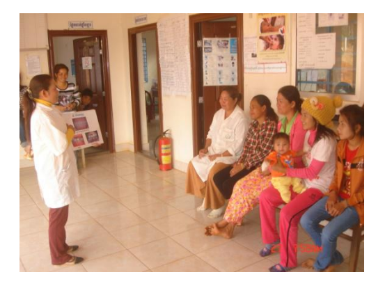
Fig.11 (Oral Health Education to Villager by Ou Reang HC Officer)