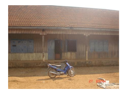
Fig.9 (Dak Dam PS Students Start Short-Term Vocation Early)