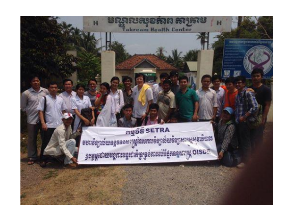
Fig.13 (Take Picture after Finish Oral Education & Treatment at Ta Kream Health Center