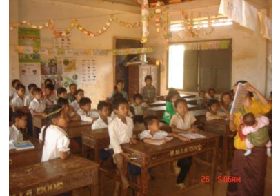
Fig.5 (Oral Health Education by Teacheer at Leng Choung PS )