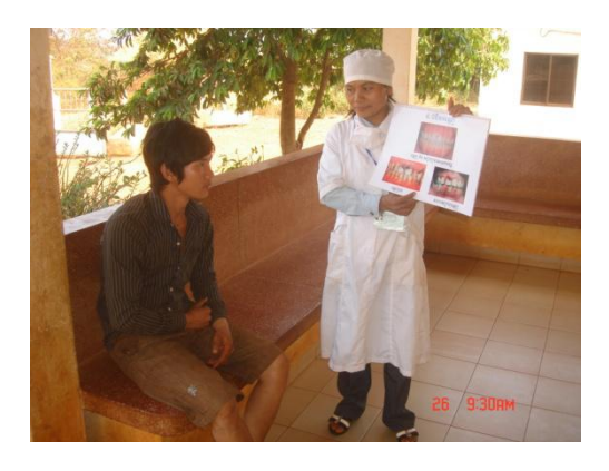
Fig.10 (Oral Health Education to Villager by Koh Nhek HC Officer)

After OISDEC staff provided Oral Health Education by flipchart to HC staff, we have flexible schedule to follow-up their oral health education at each health center!