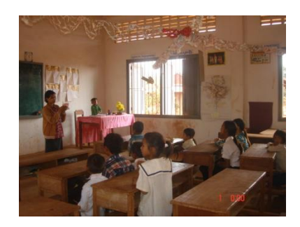
Fig.6 (Oral Health Education by Teacheer at Poutrou Leu PS)