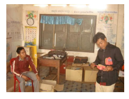
Fig.1 (Oral Health Education By Teachers at Ou Te Thmey PS )