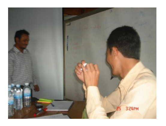
Fig.15 (Vote for Position of Director of Sub-Health Committee)