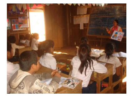
Fig.4 (Oral Health Education by Teacheer at Pou Rolar PS )