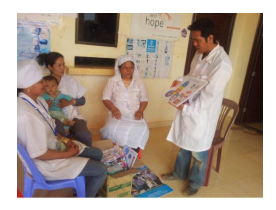
Fig.18 (Oral Health Education to Ou Am HC by Health Promotion Officer)

OISDEC staff provided Oral Health Education by flipchart to HC staff in order to ask them to promote and share the knowledge to their community. Our DCAs have already been known by targeted HC when they came up to HC with identification letter from PHD. DCAs required working at HC a day per week and as for the schedule, HC director could have authority to ask them to change to fit with HC schedule.