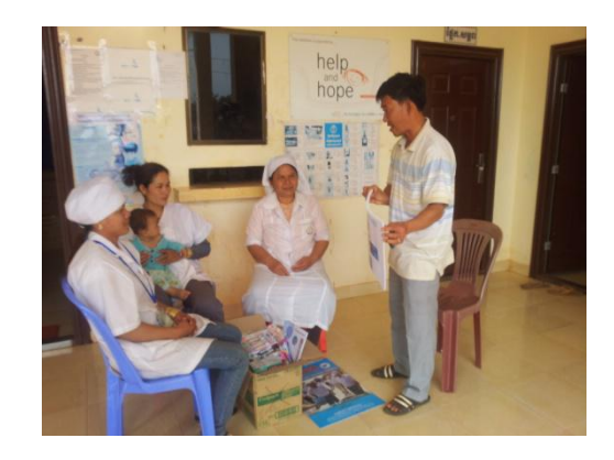
Fig.19 (Oral Health Education by Ou Am HC)