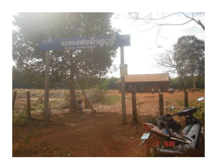
Fig.3 (Pou Chrey PS)