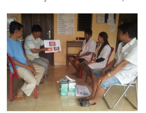
Fig.20 (Oral Health Education to Keo Seima HC by Health Promotion Officer)