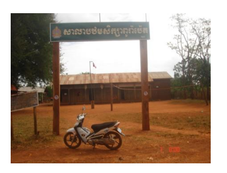
Fig.13 (Oral Health Education By Teachers Fig.14 (Oral Health Education By Teachers Fig.15 (Oral Health Education By Teachers at Pou Rapet PS ) at Pou Rapet PS ) at Pou Rapet PS )