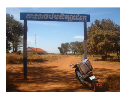
Fig.07 (Oral Health Education By Teriogets (Received TB, TP, Flipchart & DentalModel By