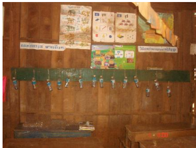
Fig.19 (How to Keep TB & TP Pou Loung PS)