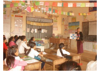
Fig.15 (Oral Health Education by Teacher at Poutaing PS)