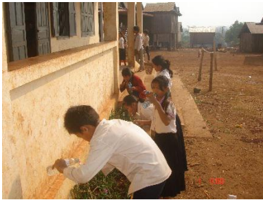
Fig.16 (Brushing Teeth by Students at Lao Ka PS )