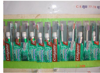
Fig.18 (How to Keep TB & TP at Poutaing PS)