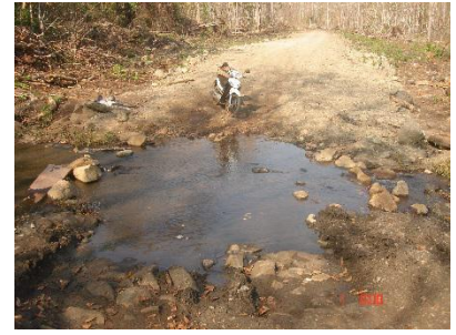
Fig.09 (This water is possible to across to Lao Romeat PS )