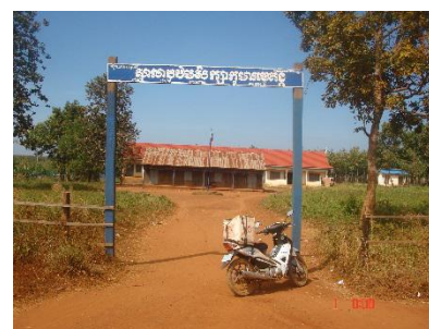
Fig.3 (Koma Mekong PS )

DentalModel By Teachers at Koma Mekong PS )