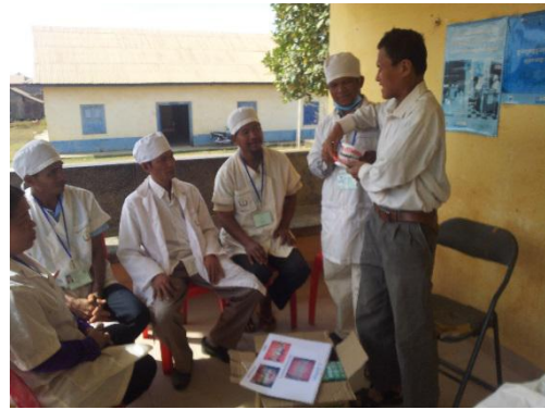
Fig.23 (Oral Health Education by Koh Nhek HC)