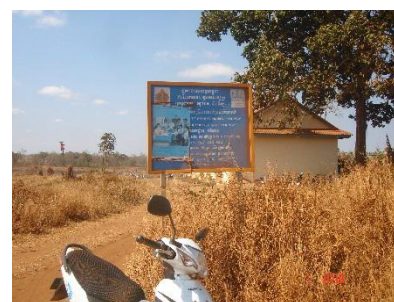
Fig0.6 (Ou Ro Poy PS without main Gate )

DentalModel By Teachers at Ou Ro Poy PS )