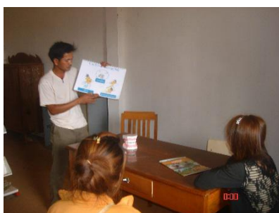
Fig.1 (Oral Health Education By Teachers