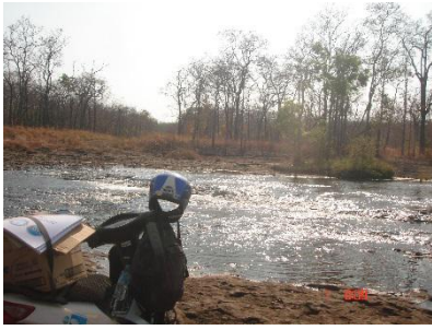
Fig.07 (Road Condition to Lao Romeat PS that impossible for us to across the water in this month )