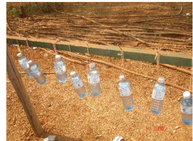
Fig.21 (How to Keep Water for Brushing at Pouloung PS)