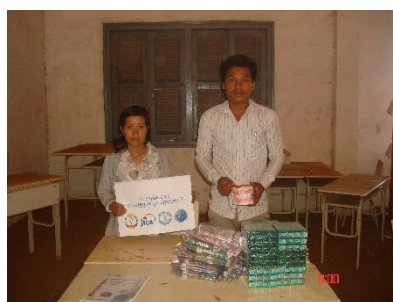
Fig.05 (Received TB, TP, Flipchart &

DentalModel By Teachers at Ou Ro Poy PS )