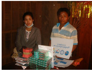
Fig.11 (Oral Health Education By Teachers at Lam Mes PS )