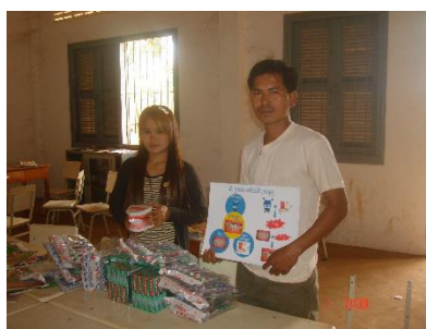
Fig.2 (Received TB, TP, Flipchart &

DentalModel By Teachers at Koma Mekong PS )