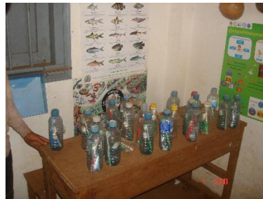
Fig.20 (How to Keep TB & TP at Lao Ka PS)