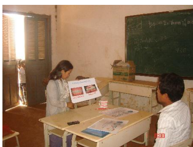
Fig.04 (Oral Health Education By Teachers