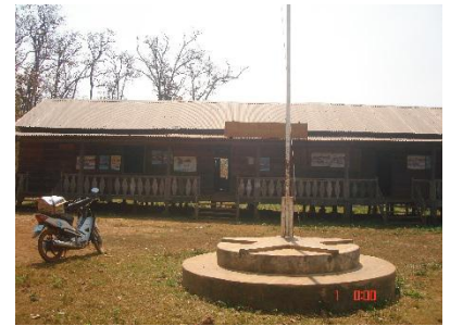
Fig.12 (Oral Health Education By Teachers at Lam Mes PS )