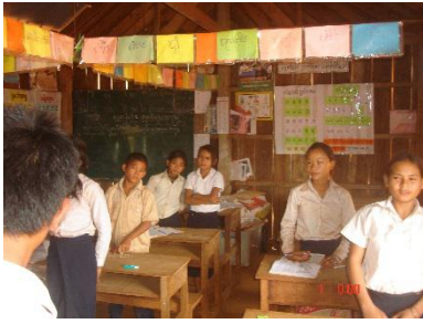
Fig.13 (Oral Health Education by Teacher at Poutrom III PS )