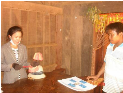
Fig.10 (Oral Health Education By Teachers at Lam Mes PS )