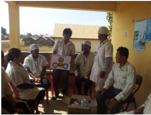
Fig.22 (Oral Health Education to Koh HC by Health Promotion Officer)

OISDEC staff provided Oral Health Education by flipchart to HC staff in order to ask them to promote and share the knowledge to their community. Our DCAs have already been known by targeted HC when they came up to HC with identification letter from PHD. DCAs required working at HC a day per week and as for the schedule, HC director could have authority to ask them to change to fit with HC schedule.