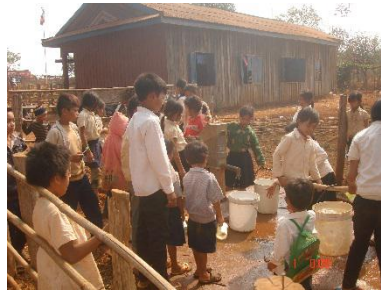
Fig.17 (Brushing Teeth at Pou loung PS)