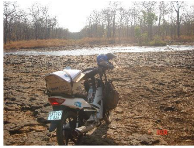
Fig.08 (Water is still big within this month PS )